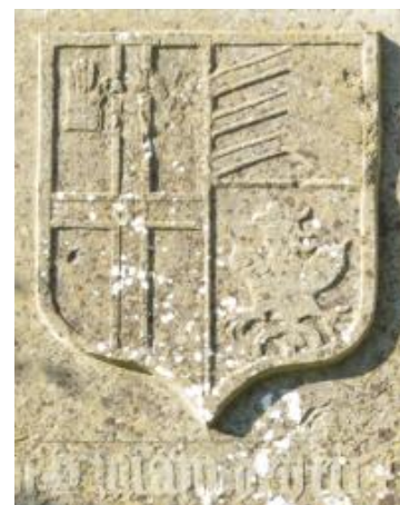
Detail from photo below

SPES MEA IN DEO EST ( my hope is in God ).