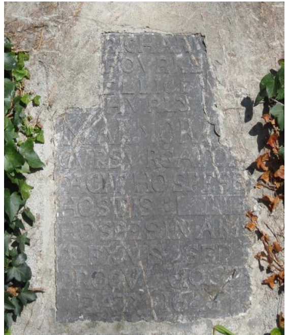
Mural Tablet Stone from Bourke's Castle