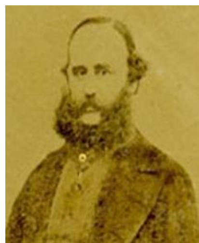
George Victor Du Noyer