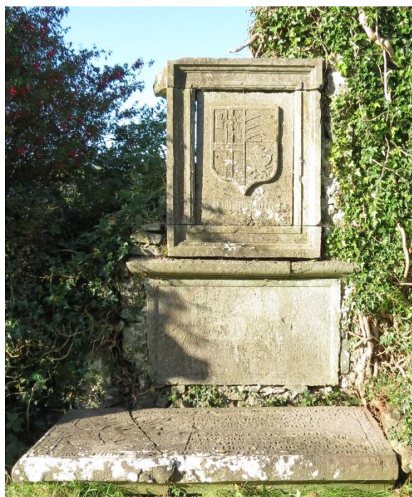
De Burgo / O'Dwyer Tomb in Glenkeen

This seems to have been a pious afterthought to give proper Christian conclusion to the table stone epitaph underneath. As made, this had no dating, though an almost illegible 1623 was scratched in later, but the word, pointing, and the personages suggest a somewhat earlier period. It reads: