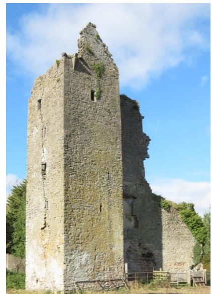
Bourke's Castle today