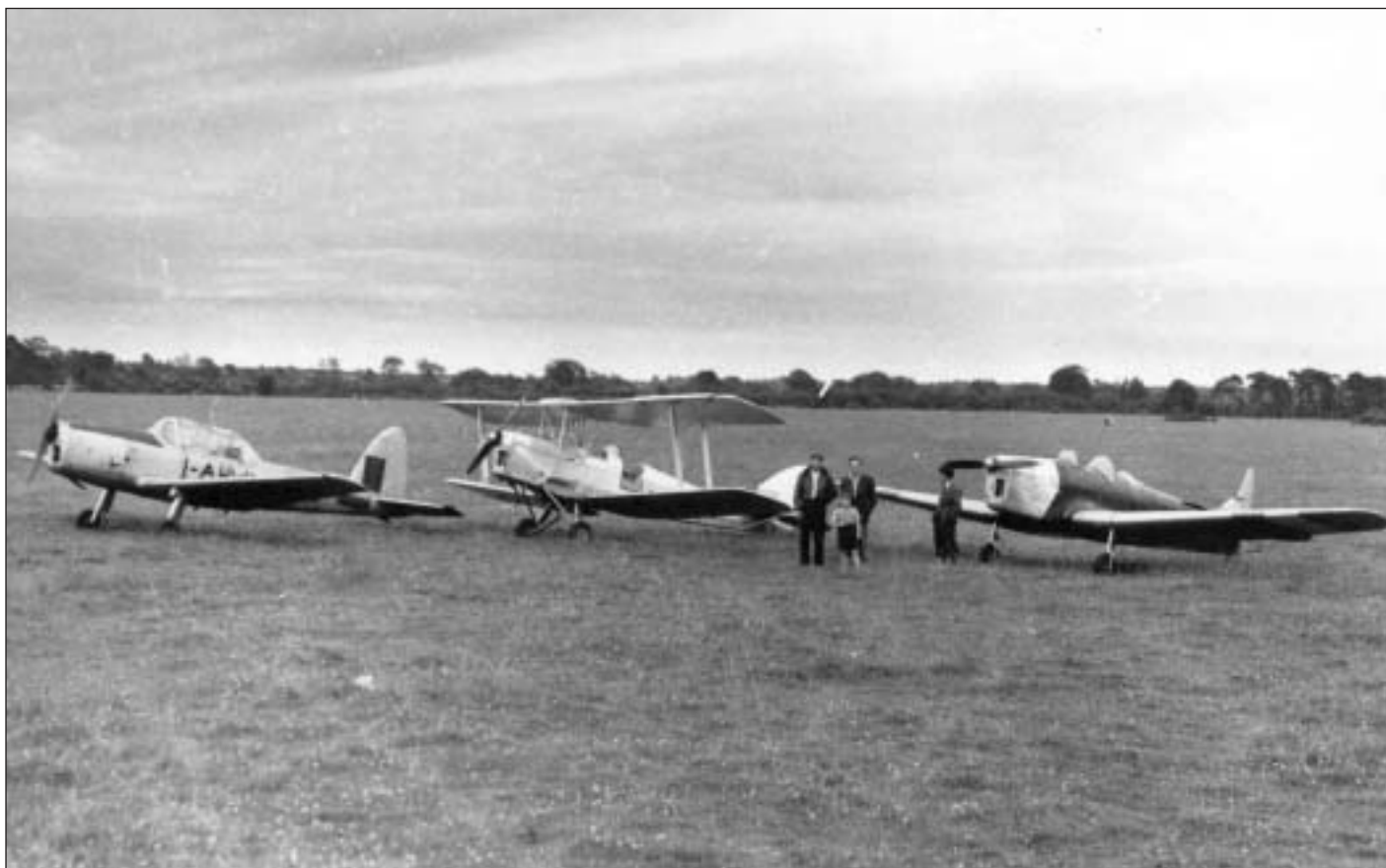
A Familiar Sight in the 1960s Aeroplanes landing at Garrane on Cooke's farm.