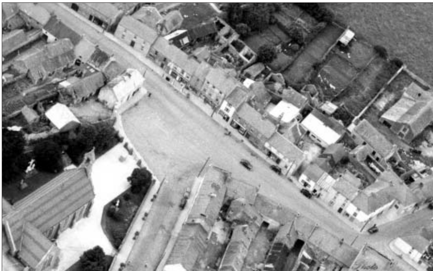
Aerial View of Main Street in the 1950s Note: Old chapel on the extreme right.