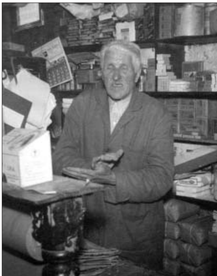
Old Time Shop