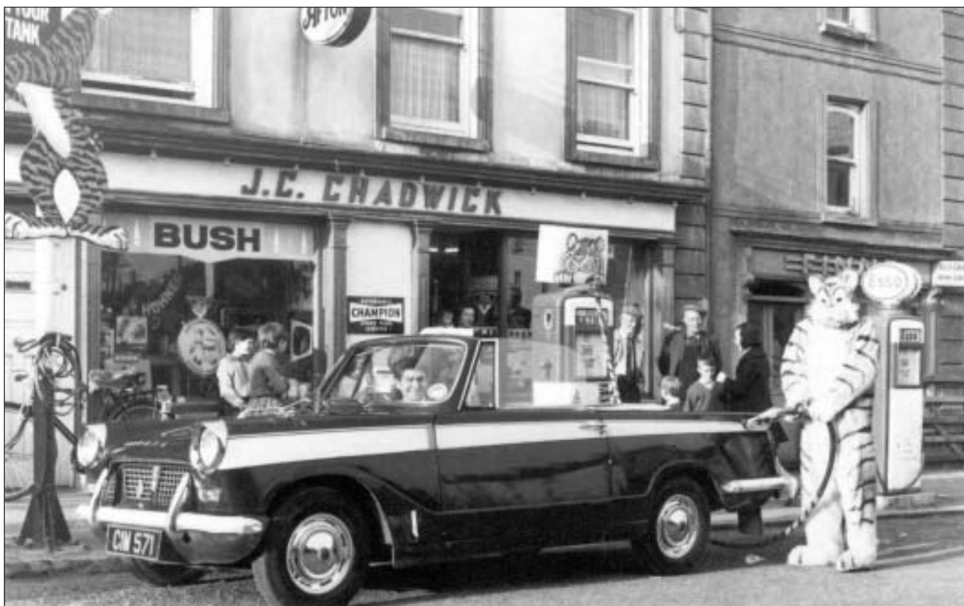
Put a Tiger in your Tank An Esso petrol promotion in Chadwick's Main Street in the 1960s.