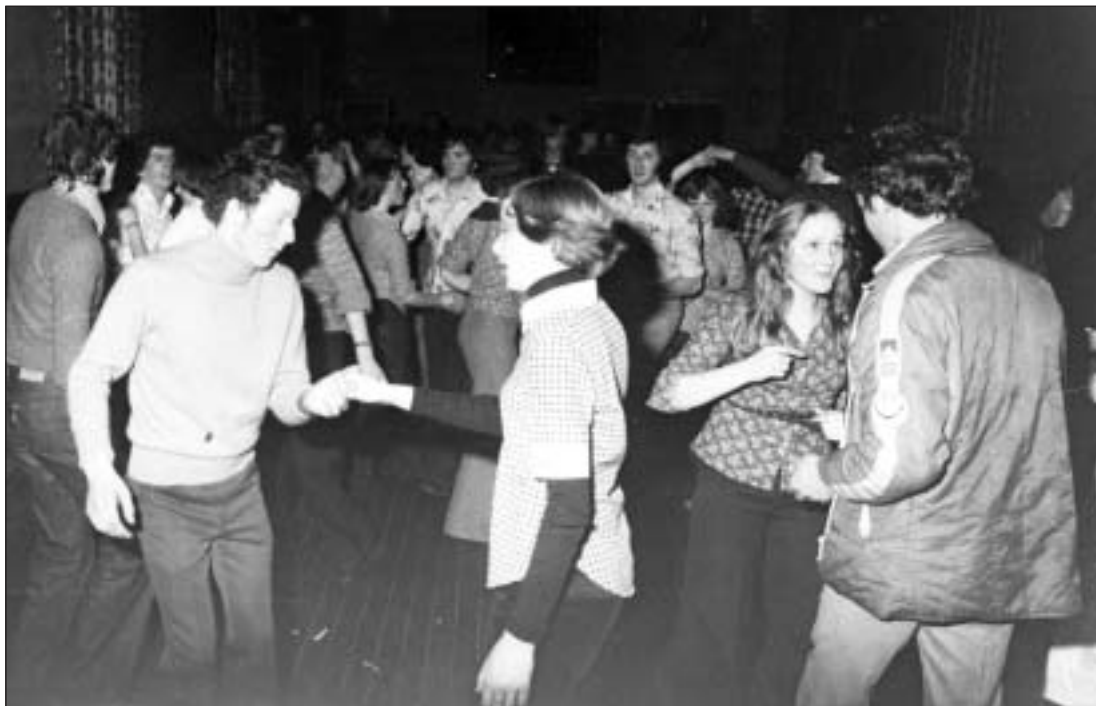
Dancing in the Marion Hall in the 1970s