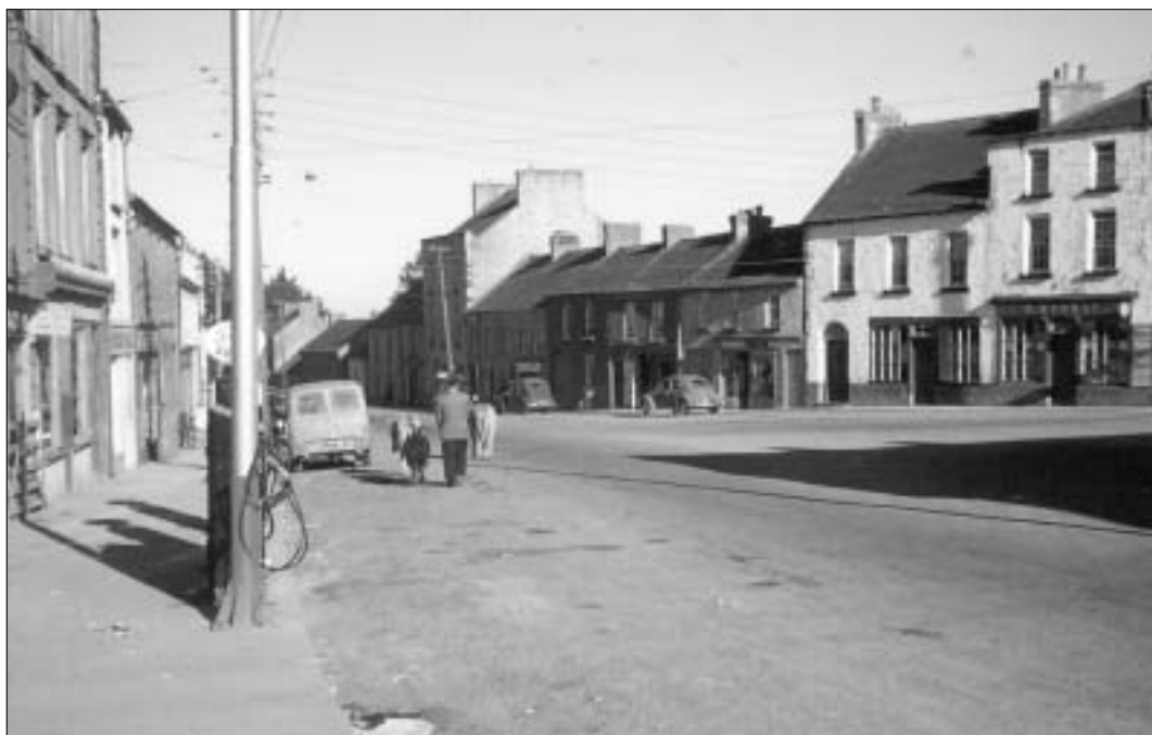
A Quiet Day in Main Street 1960s Note: T. Murray where the Clodagh Bar is today.