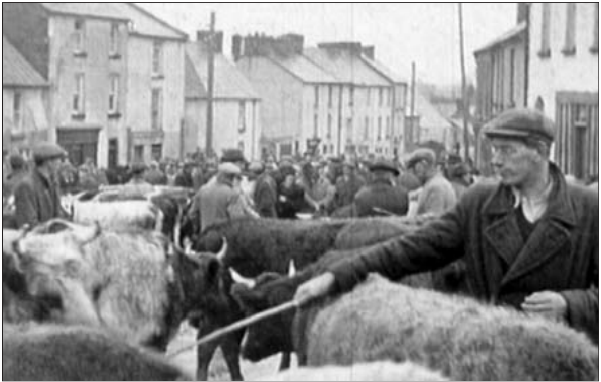
Fair Day Scene, McDonagh Square