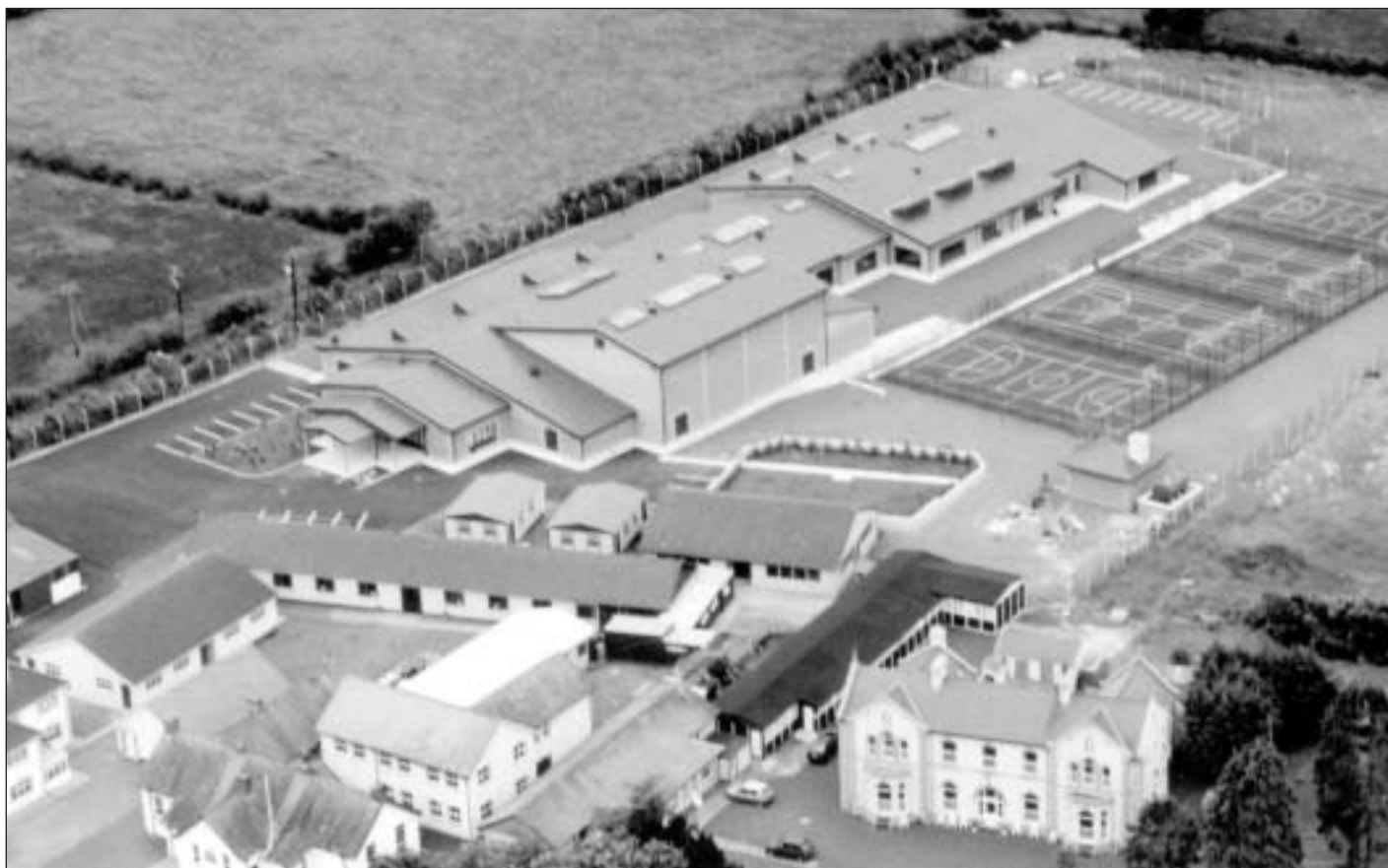
Aerial photograph of St. Joseph's College - 1998

Pictured above is the new St. Joseph's College with older buildings in the foreground and the former Convent of Mercy on the right hand side.