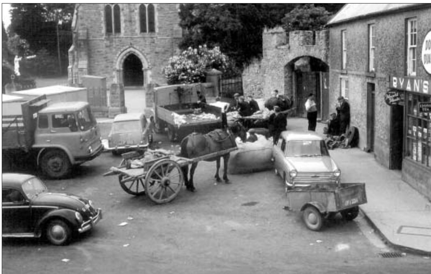
Wool Market in McDonagh Square - 1960s