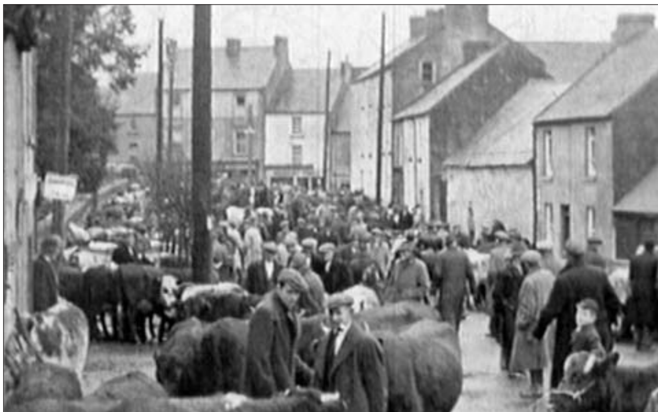
Fair Day Scene, Pallas Street