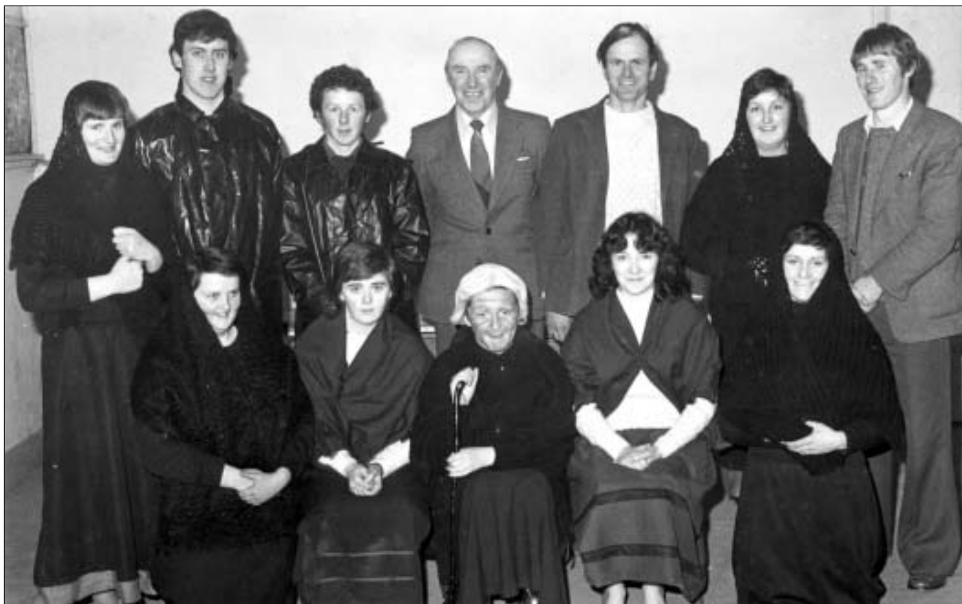
Drama Club - perform 'Riders to the Sea' in the 1970s