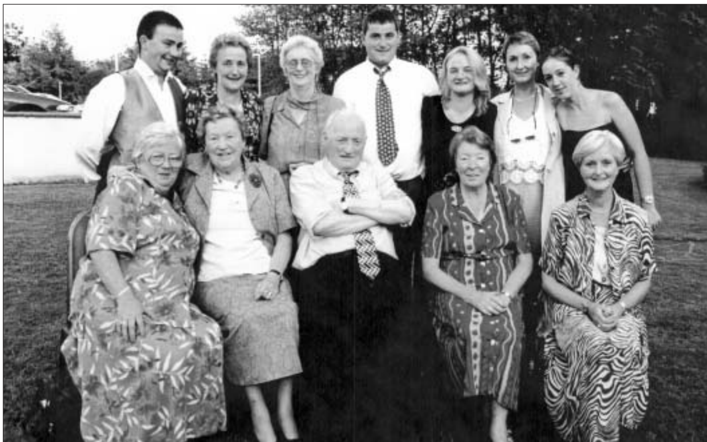
Shanahans, The Bridge, Chapel Street