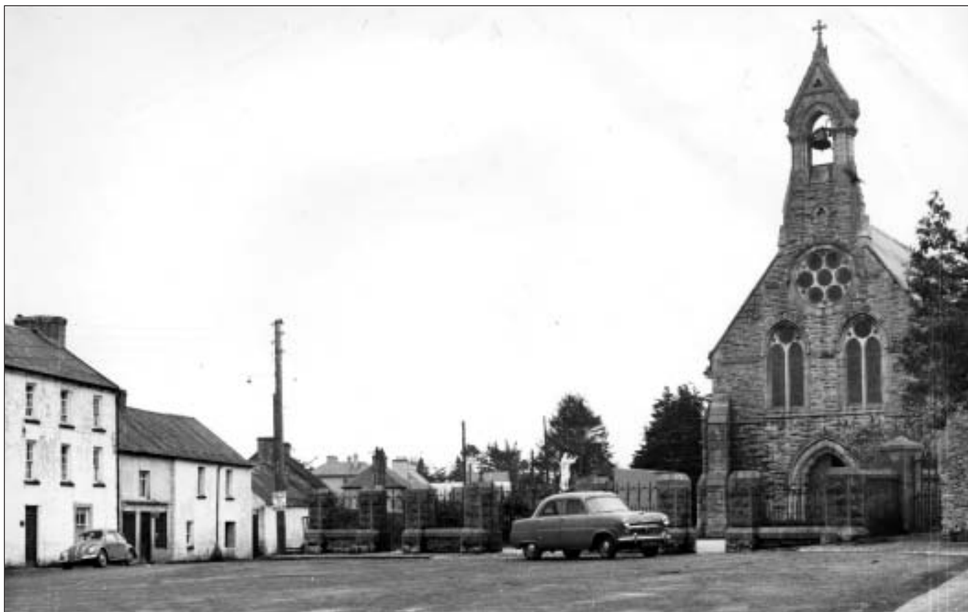
McDonagh Square 1960s