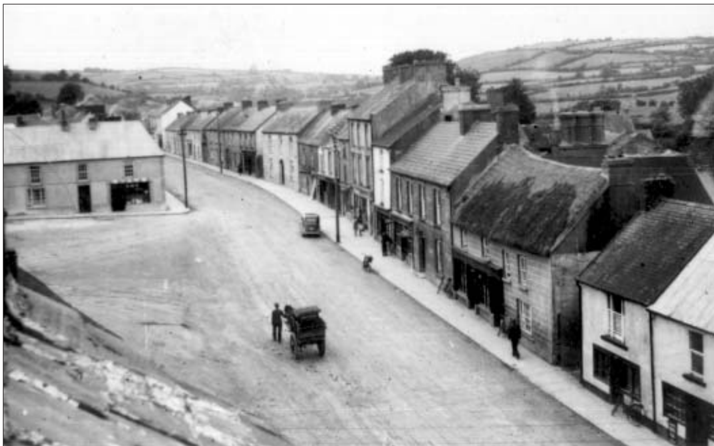
Aerial View of Main Street - late 1940s