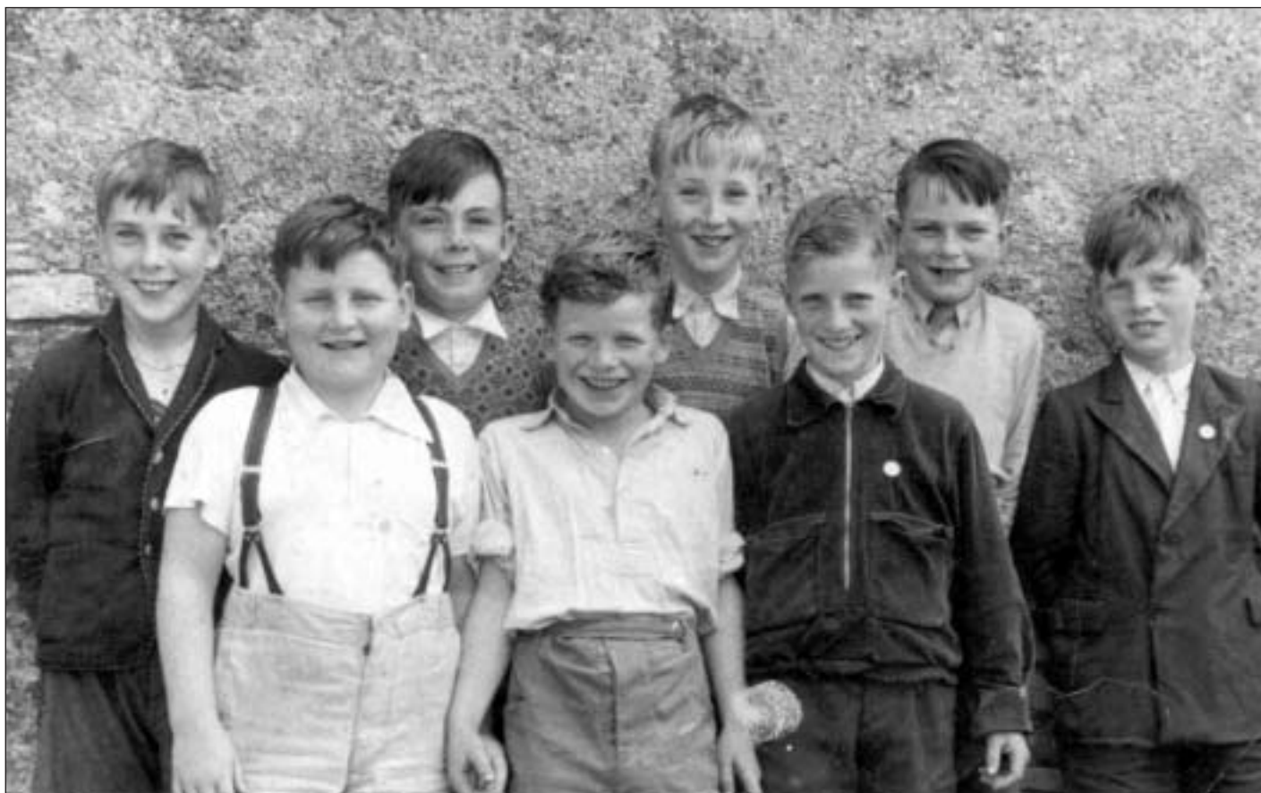
Late 1950s in the Boys' Old National School, Main Street