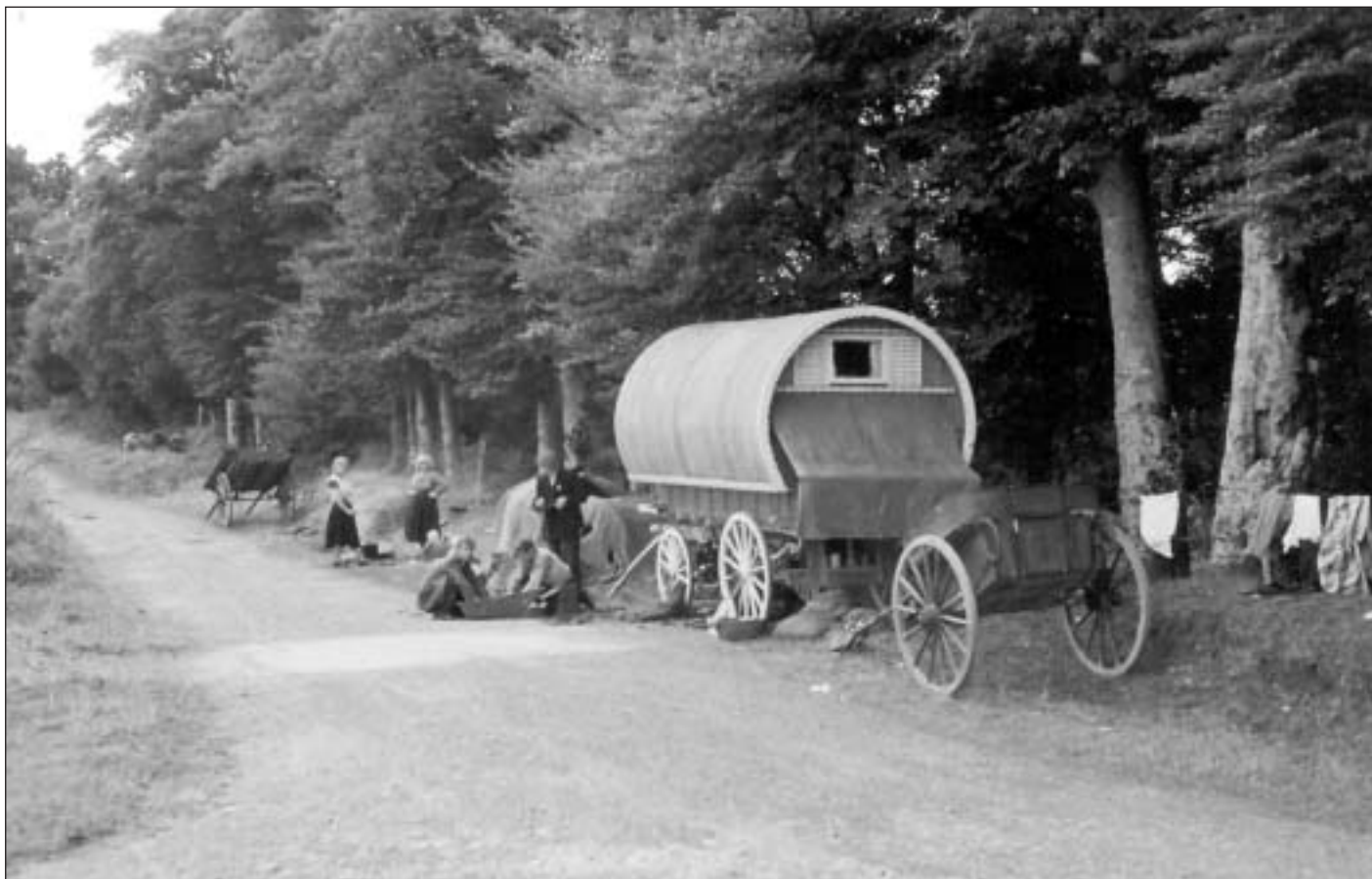
Traveller's Camp, Summerhill - 1960s note: the old style horse-drawn wagon