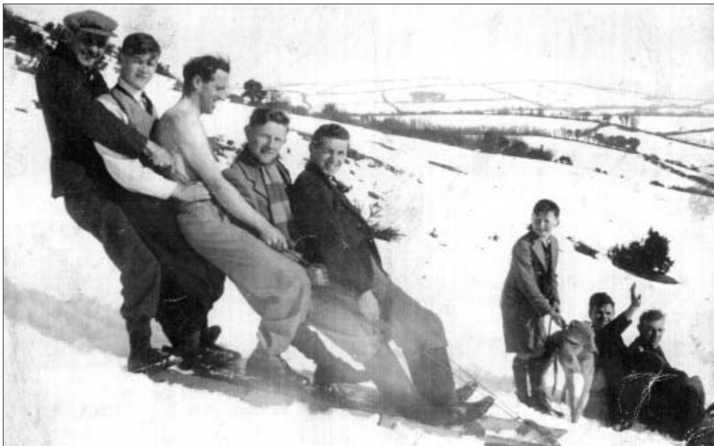
A Snowy Morning in Glenanogue - 1940s