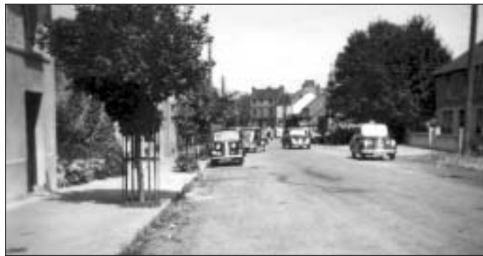
Pallas Street in the 1950s