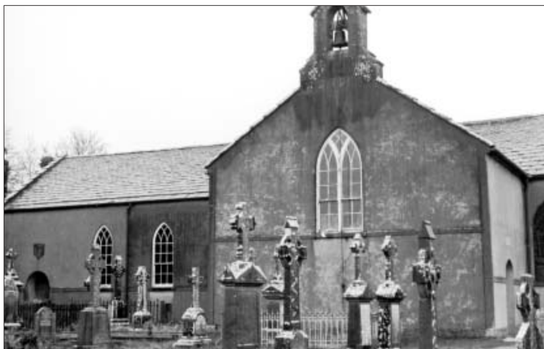
Ileigh Church The foundation stone was laid for this church in 1826. It has always been simply known as "Ileigh Church". It was built in the style known as a "Barn Church" - there are no windows on one side of the main aisle.