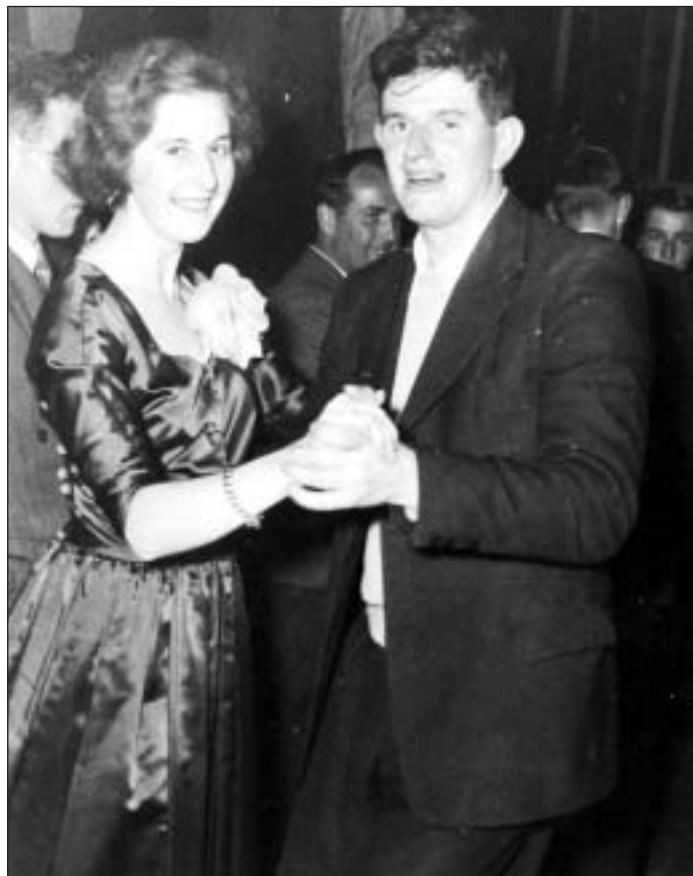
Dancing in the Marion Hall - late 1950s