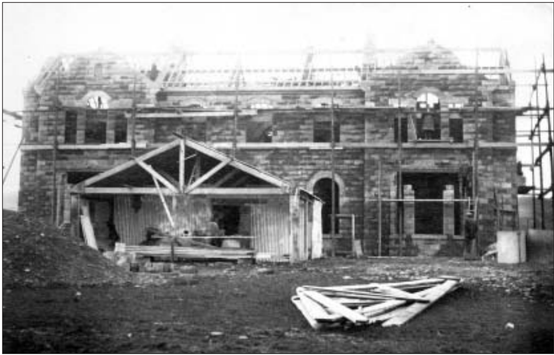
The Convent of Mercy, Pallas Street under construction in the 1930s. It was built on the site of a former Fairgreen.