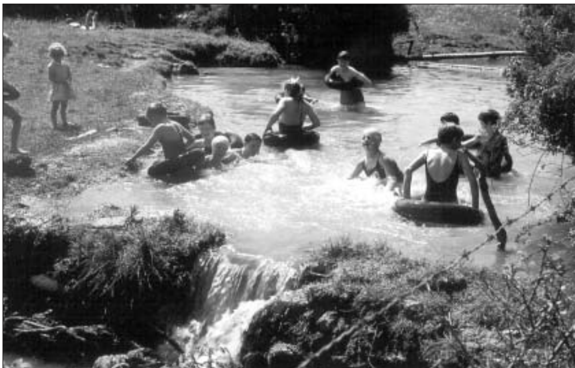
Swimming at Cappanilly This river is behind Shanahan's Foodmarket.