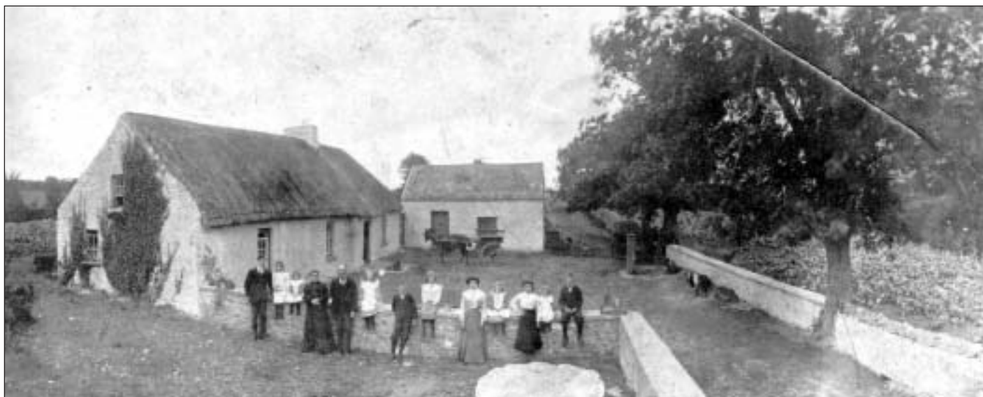
Burke's of Kylecrue c. 1900