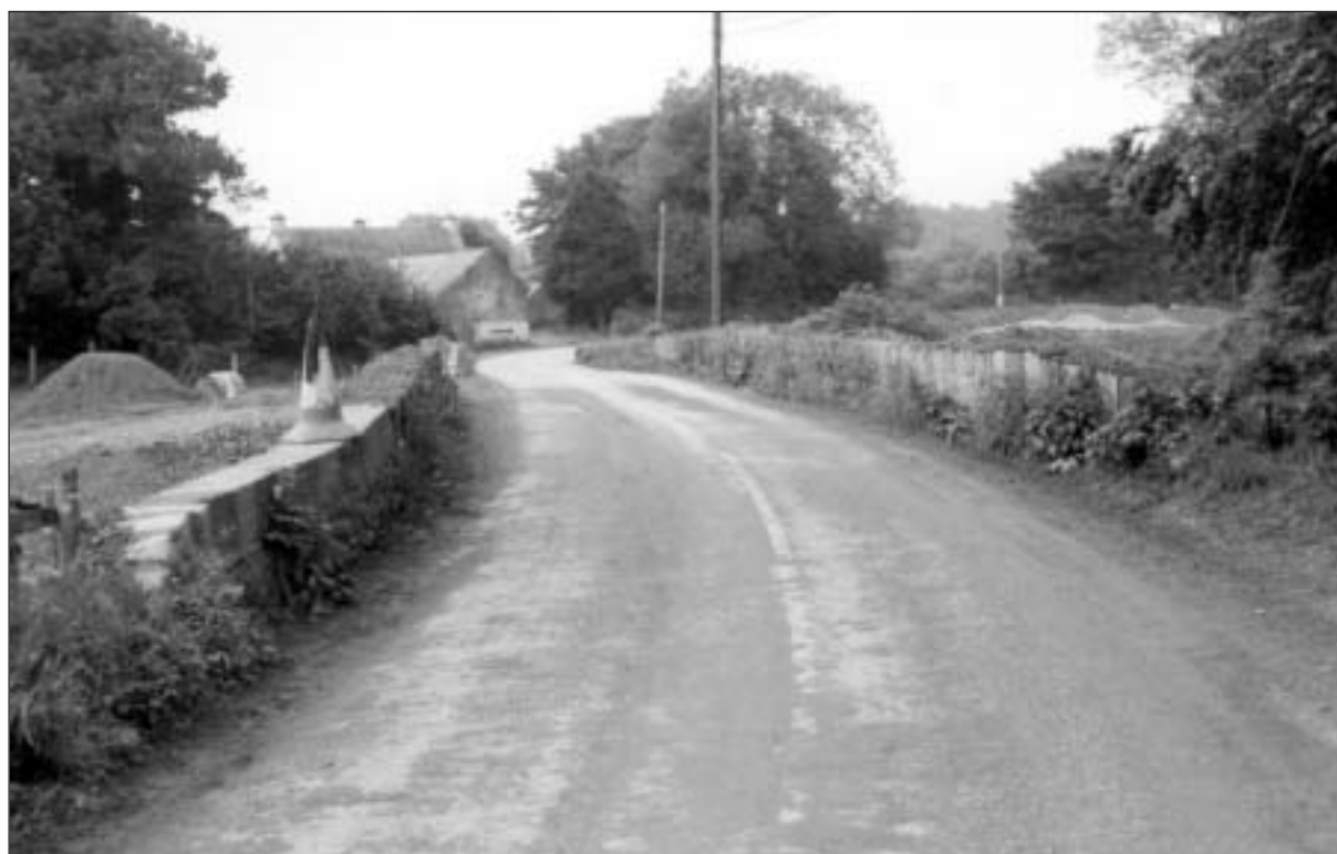
Old Rathmoy Bridge (Built in 1746) Pictured here before road improvements.