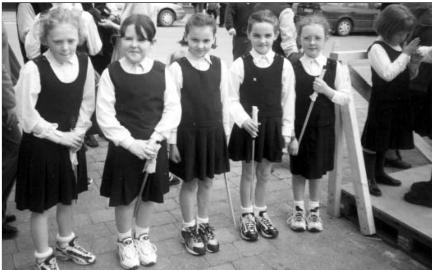
County Fleadh, Borrisoleigh - 2000