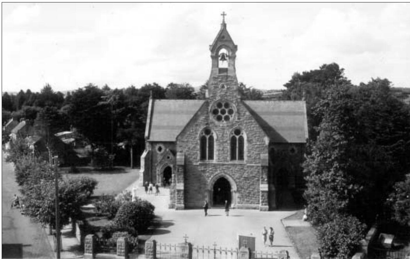
Sacred Heart Church