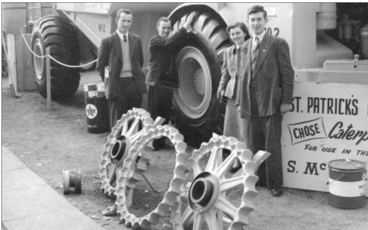
At the Spring Show