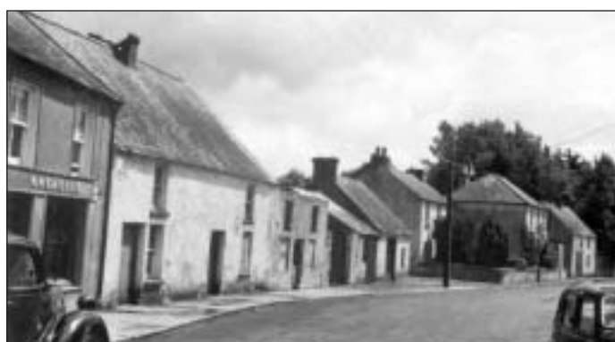
Lower Street in the 1950s