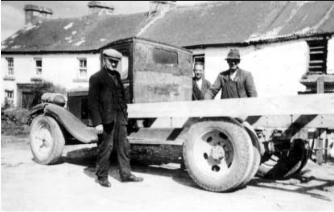
Tom Maher, Owen Darmody and Mick Darmody (fuel merchants) Note: Old Dispensary in background in Pallas Street.